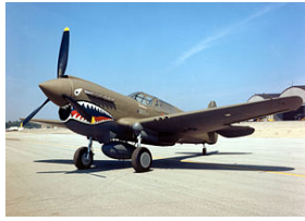
Byron P-40 kit. $1200.00

Contact Richard Rittmiller at 909 984-0583 or at Ramboamt@verizon.net Delivery to the club field is included. Shipping to another location is extra.