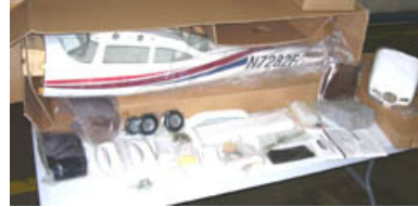
Hanger 9 Cessna Skylane 182. $500.00

This is a NIB ARF I will include the Robart scale nose strut with it. Contact Richard Rittmiller at 909 984-0583 or at Ramboamt@verizon.net Delivery to the club field is included. Shipping to another location is extra.