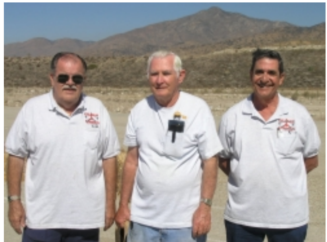
Our guests from Gilman Springs Flyers (and our pylon judges for the day). These guys are working hard to expand our racing format and promote inter-club competition.